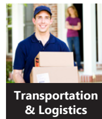
Transportation & Logistics